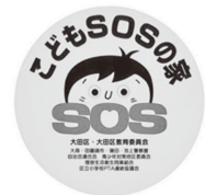
Kodomo SOS Home Sticker

Tell your child in advance that they can ask for help from neighborhood stores, homes, and convenience stores with a "Kodomo SOS" sticker, in addition to police boxes.