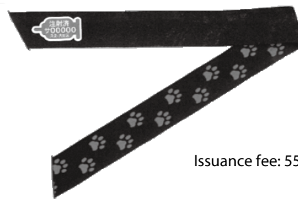
2021 vaccination tag