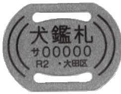
Dog license tag