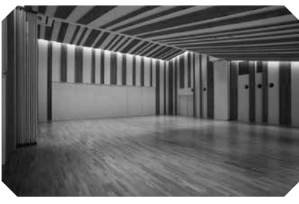
Multi-purpose Room 1

These rooms can be reserved for learning activities, hobbies (such as music or painting), or events.