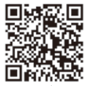
▲ Reservation Website

It is currently difficult to secure a reservation (as of July 9). For new information, check the SDF Tokyo Mass Vaccination Center's reservation website.