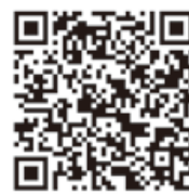
▲ Group Vaccinations